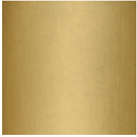
Bronze - BRZ