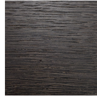
Natural Wood - NAT